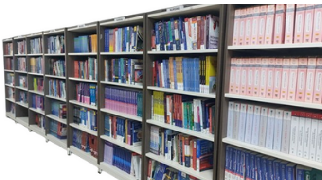
Dedicated corner for Nursing Books